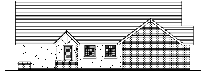
SIDE ELEVATION (ENTRANCE)